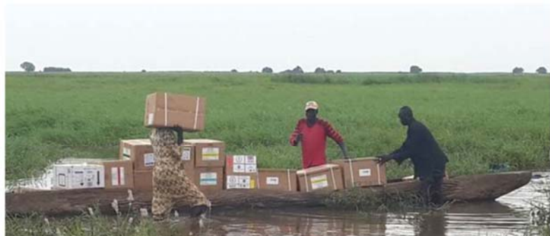
Teachers and field liaison transporting school materials using the local boat through the swamp